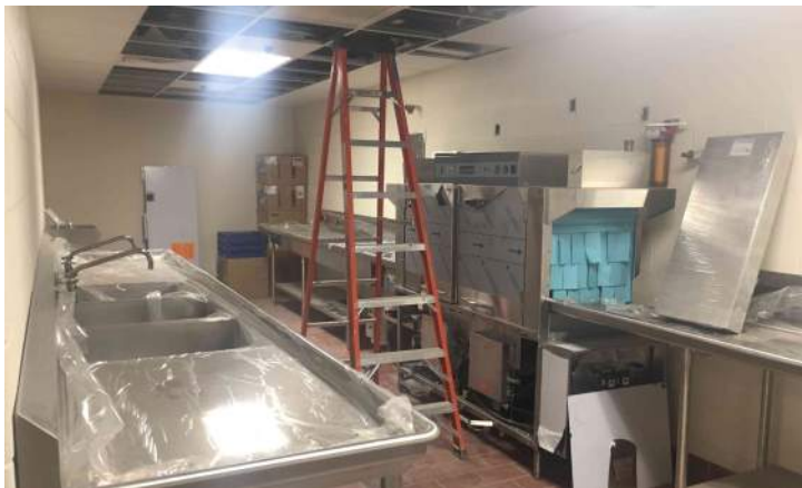
Kitchen Equipment Installation in Area E Cedar Level