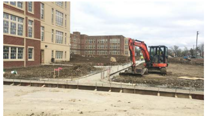
Forming Sidewalks Area G Courtyard & Area A South