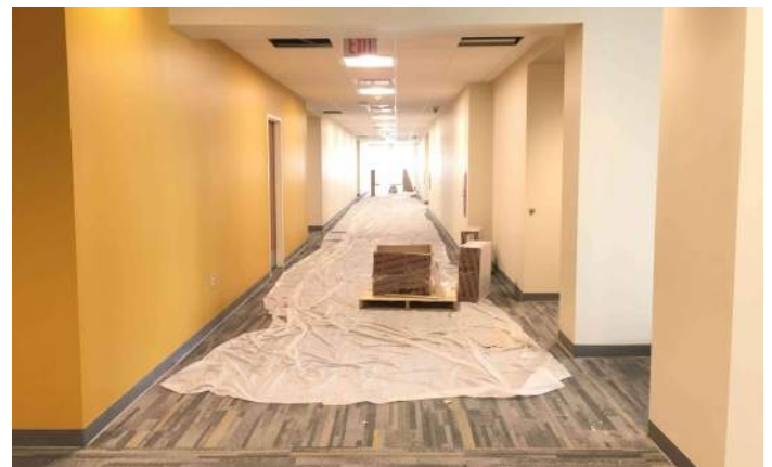
Finishes in Area A 3rd Floor Corridors