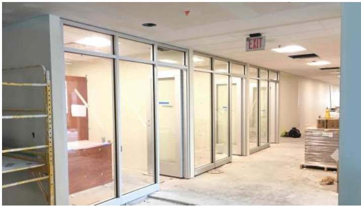
Curtain Wall Installation on Area A Cedar Level