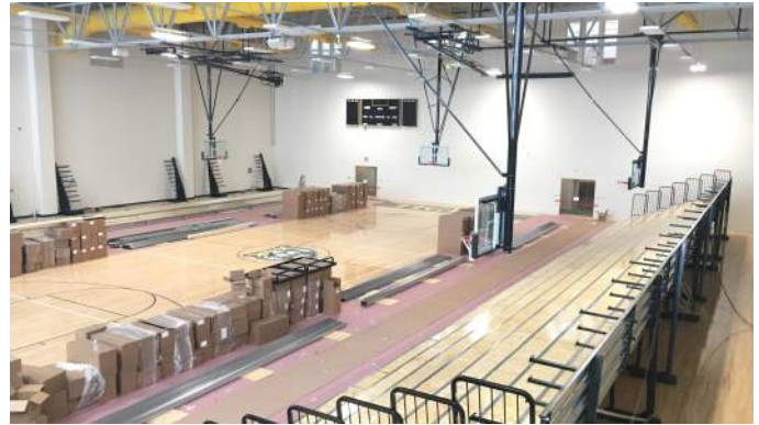
Bleacher Installation in Area C Competition Gym