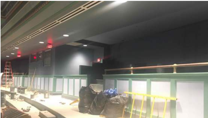
Painting on Area G 2nd Floor Auditorium Balcony